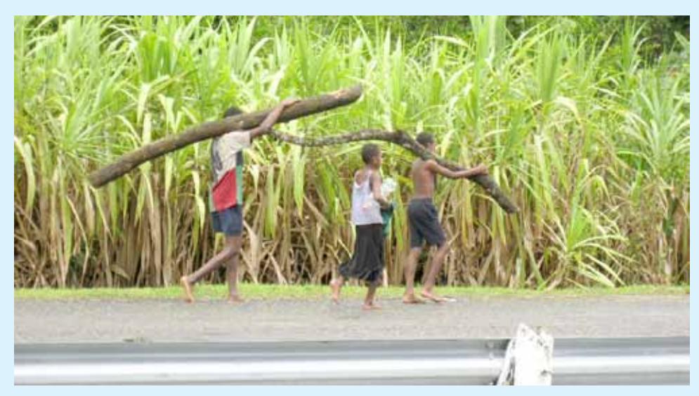
People carrying wood at Waidalice Landing, Fiji, photo by OHCHR 2011

Access to land simplified the work for government and organizations to provide housing support, as there were few or no controversies over ownership of land. There were, however, complaints regarding the speed of assistance for building housing. The Operational Guidelines indicate that the authorities should take appropriate 'measures to allow for a speedy transition from emergency shelter to transitional shelter or to permanent housing...<sup>30</sup> The Samoa study was not able to assess whether, in fact, the speed of provision of housing assistance was appropriate. However, it was clear that the affected community were not happy with the speed of this assistance. This highlighted a further concern that there were insufficient monitoring and complaint systems in place to ensure that "conditions on the ground comply with... the international human rights standards"31 in relation to the protection of internally displaced persons.32