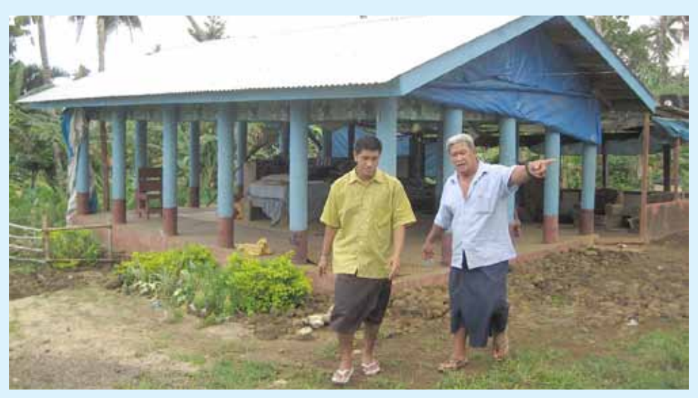
Samoa, photo by OHCHR 2010

For the central government and humanitarian organizations providing emergency tsunami-relief, the Village Chief and members of the Village Council, despite some drawbacks, were essential and useful interlocutors who knew their villagers and held authority to organise needs assessments and relief distributions. However, in the search for durable solutions on where to live after the tsunami, the reliance on the chiefly system risked the exclusion of groups that traditionally were not involved in decisions making and their concerns potentially not being taken into account.