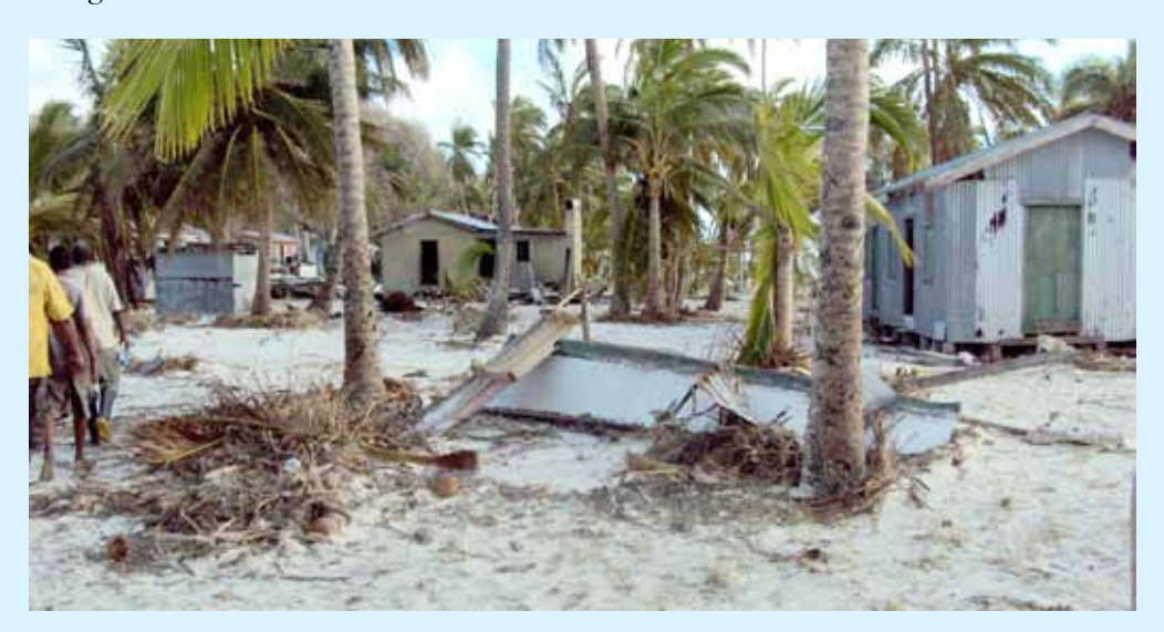
Kabara Island, Fiji, photo by the Pacific Humanitarian Team/OCHA 2010

Natural disasters in the Pacific are typically seasonal and recurrent. In absolute terms, the number of people affected is small; however, given the size of the countries, even minor damage can have a large social and economic impact on enjoyment of human rights. It is therefore important to consider the impact of natural disasters in Pacific countries according to a Pacific scale.