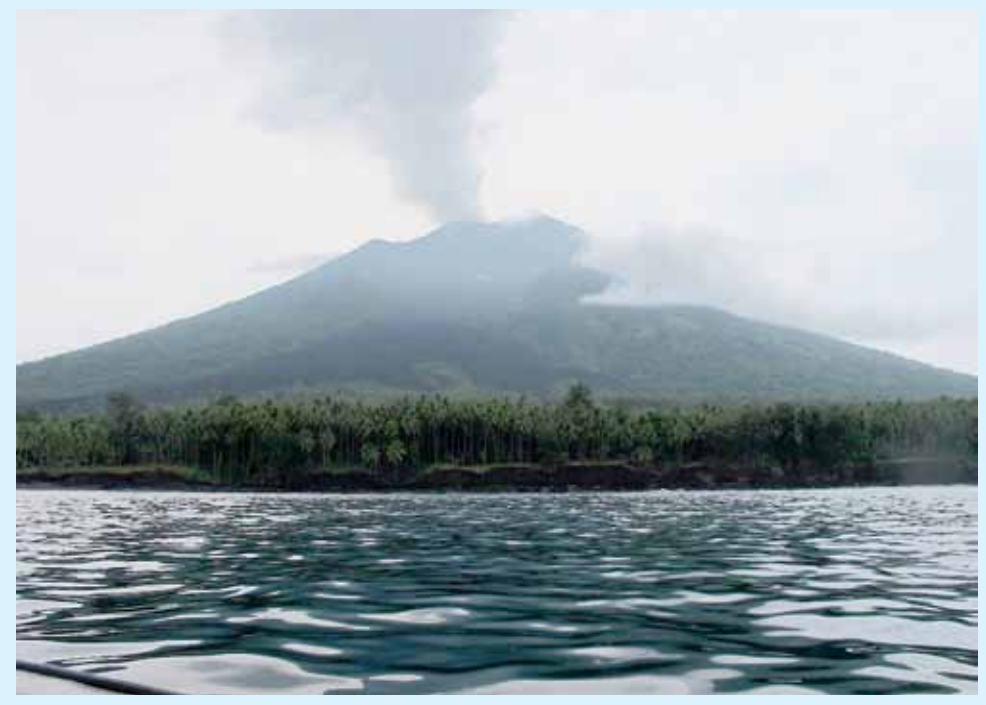
Manam Island, Photo by OHCHR 2010

Natural disasters can significantly reverse development achievements and overwhelm national authorities. However, once the initial humanitarian phase is over, it is essential that governments assume their central role and fulfil their obligations to assist IDPs in achieving durable solutions, including access to social services, housing and livelihoods. In the transition from humanitarian to early recovery activities it is vital that government and development actors engage at an early stage and begin to build foundations for longer-term recovery, even while humanitarian efforts are still ongoing. 104