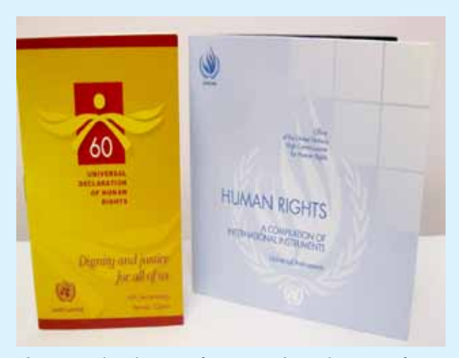
The Universal Declaration of Human Rights and CD Rom of "Human Rights - A Compilation of International Instruments"

All UN Member States have committed themselves to the human rights standards set out in the UN Charter and the Universal Declaration of Human Rights. These standards render governments responsible to ensure human rights protections for all women, men, girls and boys on their territory, including those who are displaced by natural disasters. In the Pacific, many governments are highly dependent on international development assistance, and therefore donor governments in the region also have a particular responsibility to promote and protect human rights within the Pacific.7