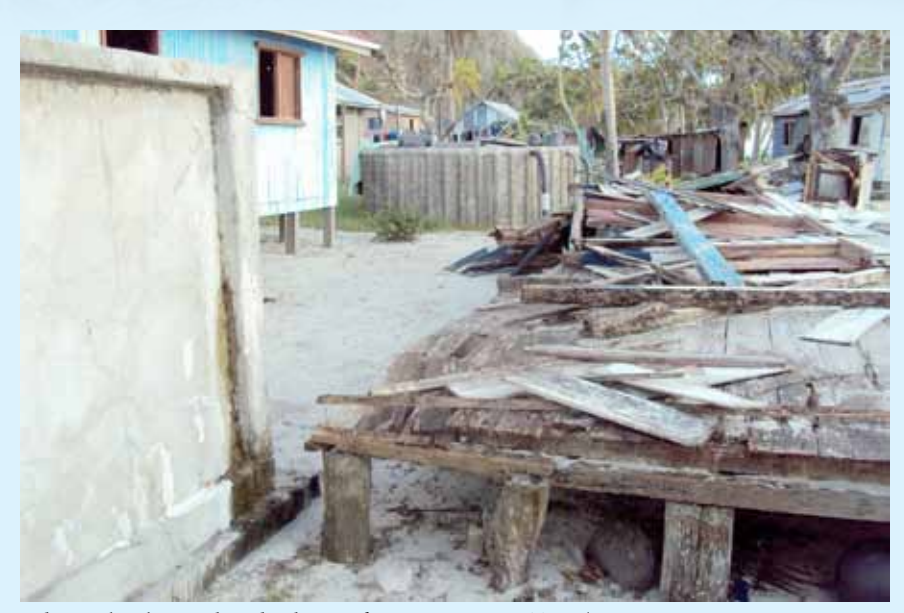
Kabara Island, Fiji, photo by the Pacific Humanitarian Team/OCHA 2010

As a direct result of the fatal clashes, a police unit from a neighbouring district was called in to forcefully evict more than 2000 displaced men, women and children back to Manam Island and burnt down the houses in the Bom Plantation care centre to ensure people did not return to the mainland. 84 As described above, Manam Island was considered not suitable for human habitation.