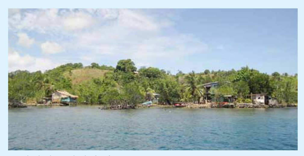
Gizo island, Solomon Islands

Gizo is a small island of approximately 37 square kilometres with a population of about 9,000. The main town is a provincial capital and the second largest urban centre in the country. Unusually for the Solomon Islands, the majority of land on Gizo is crown land.<sup>49</sup> Approximately thirty per cent of the population of Gizo are the minority Micronesian Gilbertese who were brought from Kiribati (the former Gilbert & Ellice Islands) by the British and settled in Gizo in the 1960-70s. Some were settled on Gizo and given perpetual titles over land.<sup>50</sup> However, there are disputes over how much of the land was given to them. Other Gilbertese resettled from other parts of the Solomon Islands and their claim to land was not clearly defined by law. The population also includes other ethnic Solomon Islanders who migrated from other parts of the country to Gizo. Finally, there are also communities that had returned to Gizo after generations and were in some form of negotiations with government to have land given back to them as customary owners.<sup>51</sup>