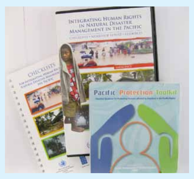
"Pacific Protection Toolkit" by the Pacific Protection Cluster, as well as CD, "Integrating Human Rights in Natural Disaster Management in the Pacific", as well as "Checklist".

The weak protection by the state seems to be caused in part by a failure to recognise the fundamental and principal responsibility of the state in situations of natural disasters, and the resulting weakness in developing and implementing effective programs and strategies that ensure human rights protection of IDPs. In some cases, governments have not allocated the required human and financial resources, complemented by accountability and monitoring mechanisms, to find durable solutions for IDPs.