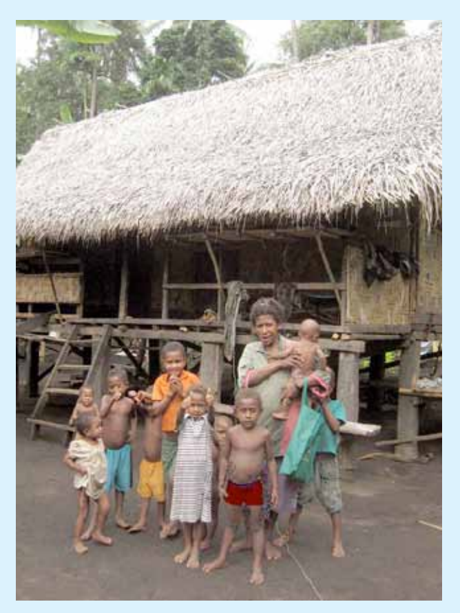
Family in Madang, PNG

In July 2007, the Cabinet adopted a full shelter and housing strategy.<sup>38</sup> However, for unclear reasons, it was not adhered to and the government decided instead to channel its housing funding through members of parliament with constituencies in the tsunami-affected region.<sup>39</sup> In practice, and according to affected communities in Gizo, this meant that their local MP arrived from Honiara and handed out small amounts of cash while escorted by the