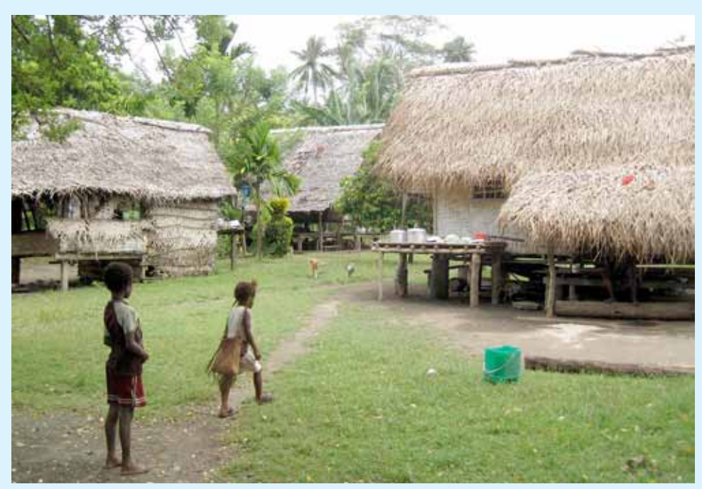
Care centre in Madang, PNG

this body was not able to identify and secure any land for the displaced.<sup>78</sup> By 2010, this body was no longer functional and had lost the confidence of the local authorities and the displaced.<sup>79</sup> A new entity, called the Manam Resettlement Task Force was established by the government in mid-2010 to revive the process of resettling the Manam IDPs.80